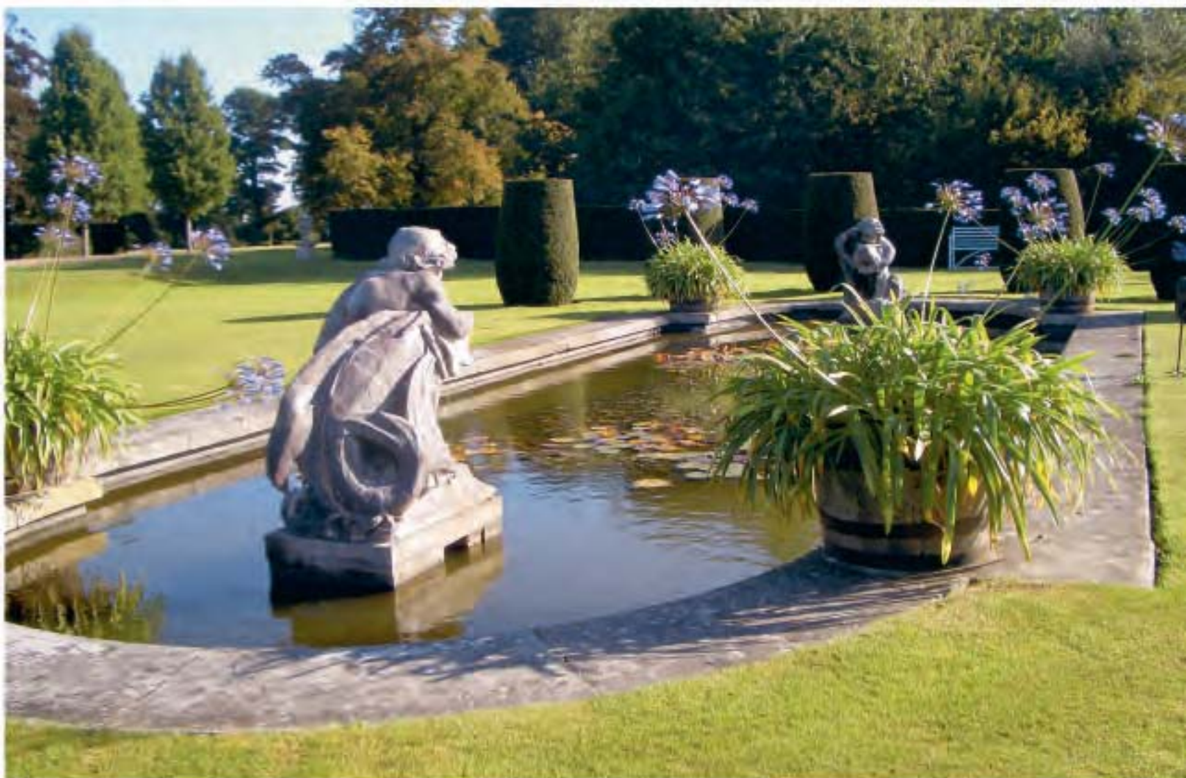
Water features add to the attractions of Hole Park.