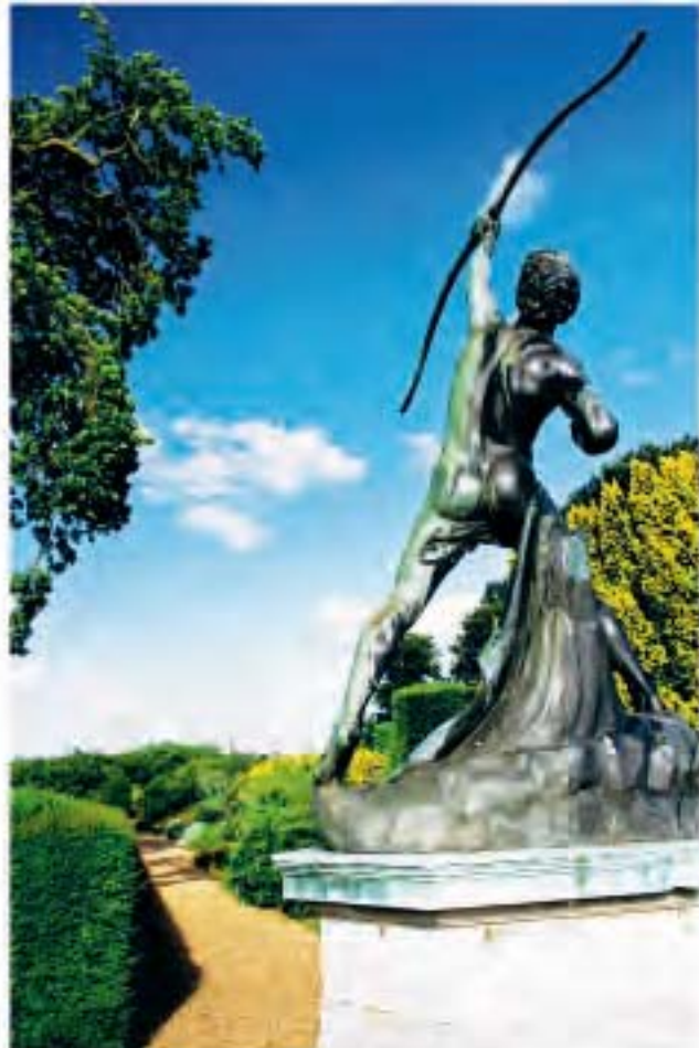
Above: The Slayer statue at Hole Park in Rolvenden Below: Italian Garden at Hever Castle